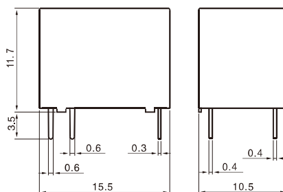
Outline Dimensions 外形图

Undimensioned tolerance: <1mm: ±0.2mm 1~5mm: ±0.3mm >5mm: ±0.4mm 未标注尺寸公差: <1mm: ±0.2mm 1~5mm: ±0.3mm >5mm: ±0.4mm